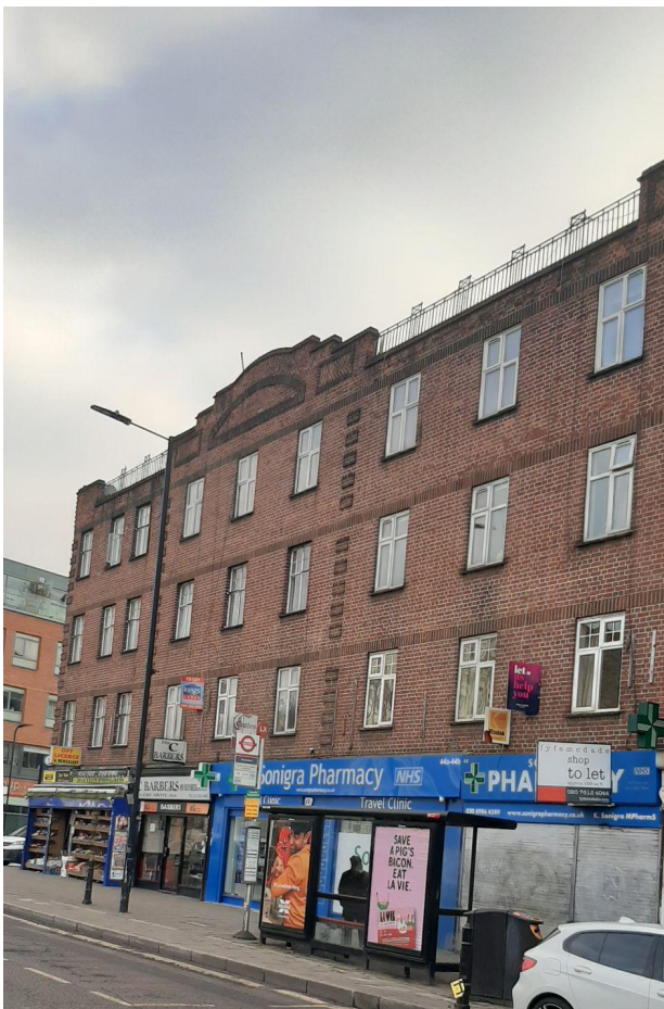
View of 44-46 Well Street from opposite side of Well Street