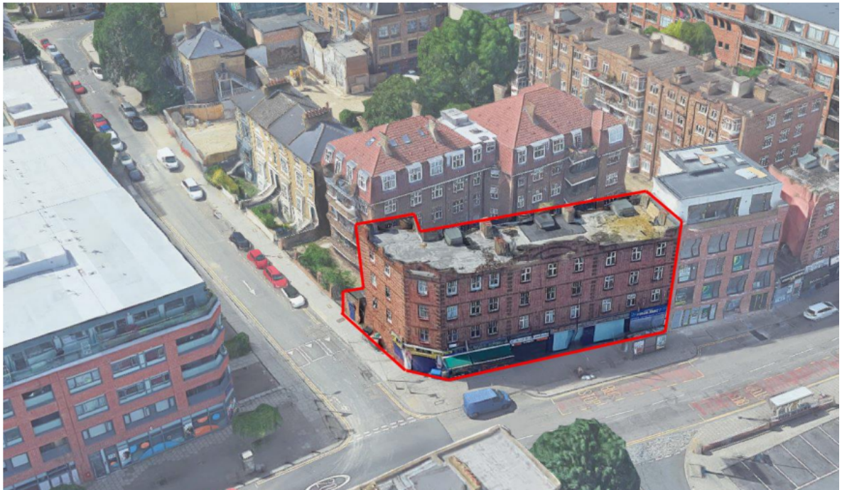
Aerial View of 44-46 Well Street